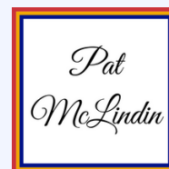
PROUD SPONSOR OF: Lachlan Kennedy