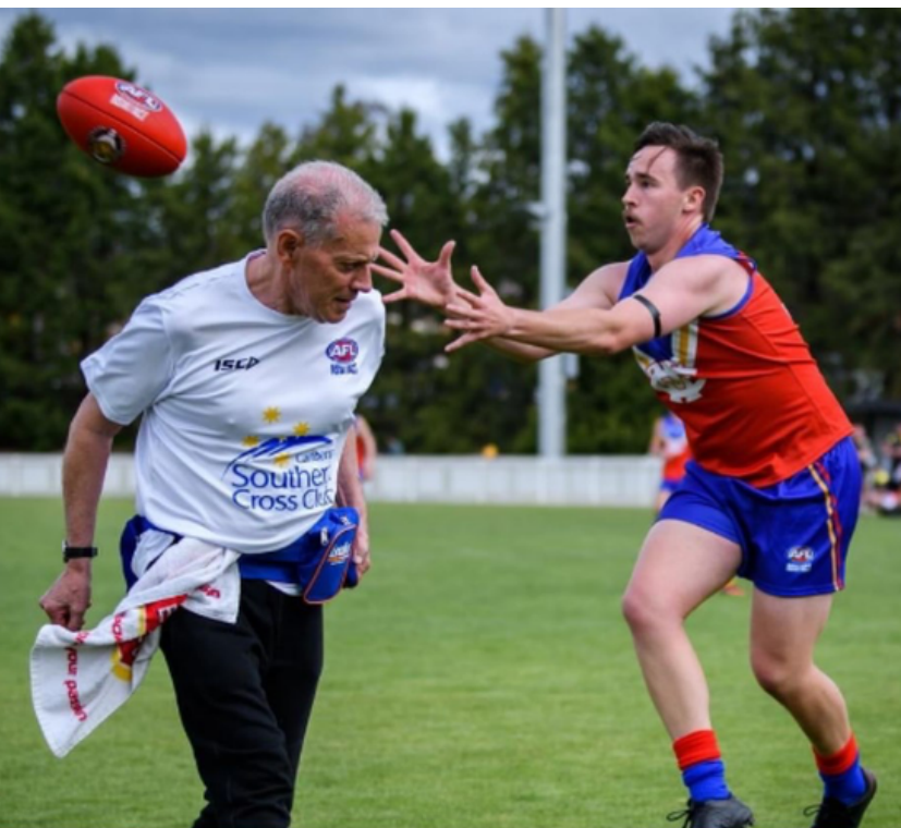
Senior Volunteer of the Month