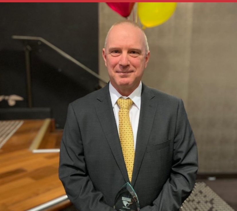
Club Volunteer of the Month