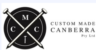
PROUD SPONSOR OF: Ethan Bates