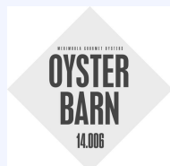
PROUD SPONSOR OF: Lily Bulter-Woollard