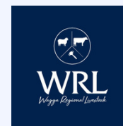
PROUD SPONSOR OF: Polly McKelvie-Hill