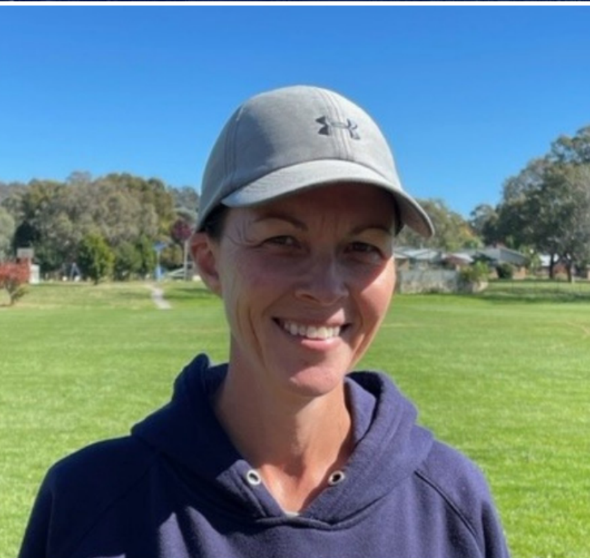
Junior Volunteer of the Month