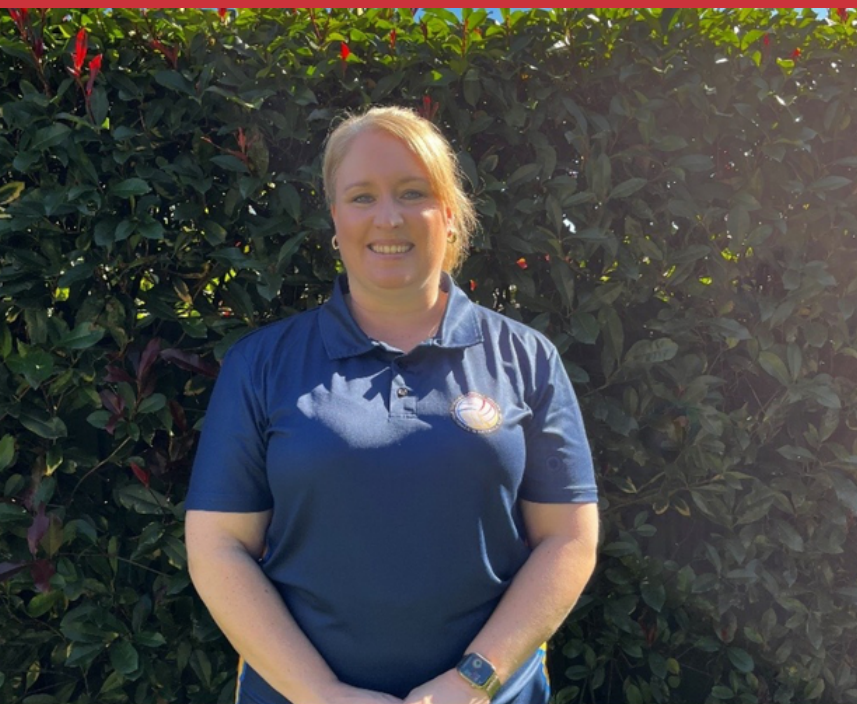
Netball Volunteer of the Month