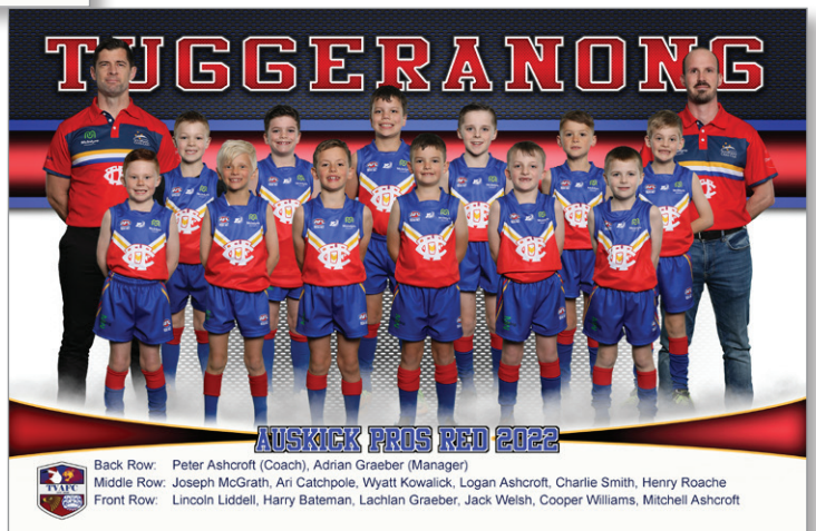
AUSKICK PROS RED 2022