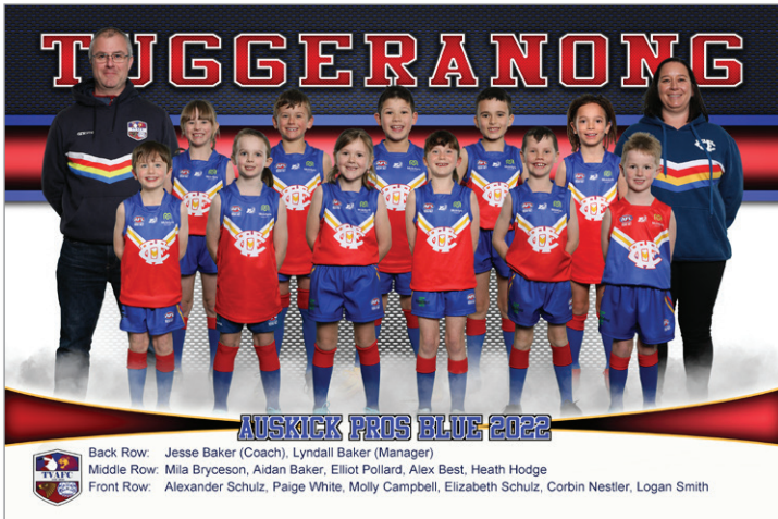
AUSKICK PROS BLUE 2022