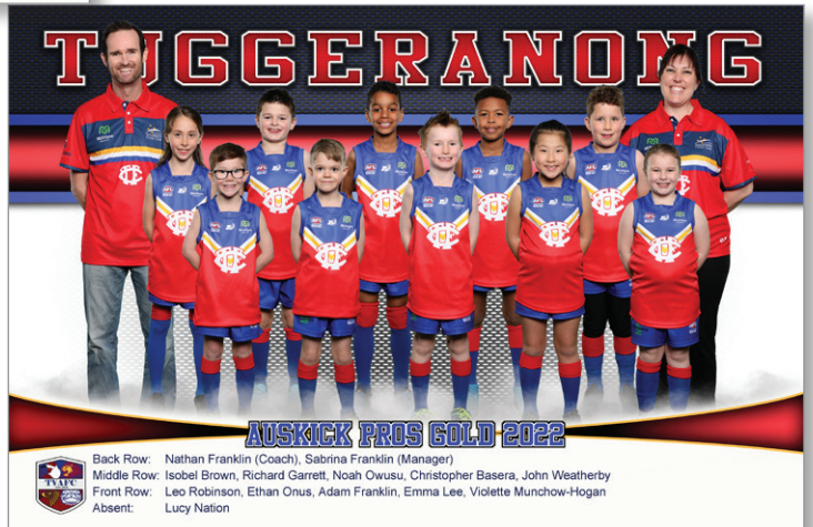
AUSKICK PROS GOLD 2022