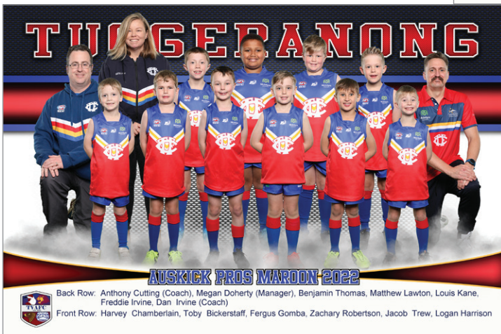
AUSKICK PROS MAROON 2022