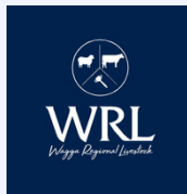
PROUD SPONSOR OF: Polly McKelvie-Hill