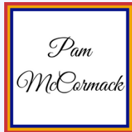
PROUD SPONSOR OF: Seth Welsh