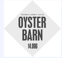
PROUD SPONSOR OF: Lily Bulter-Woollard