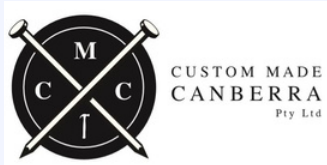
PROUD SPONSOR OF: Ethan Bates