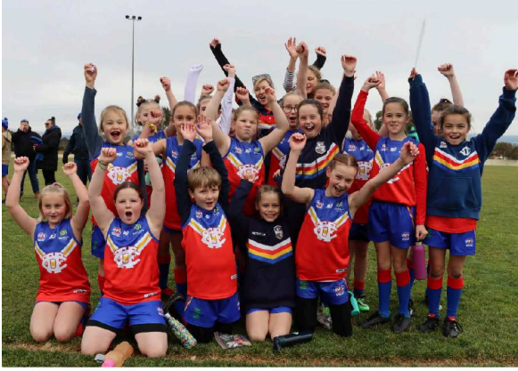
Under 10 Girls Thunder Team Sponsor