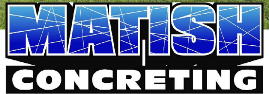
Under 16 Girls Team Sponsor