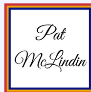
PROUD SPONSOR OF: Lachlan Kennedy