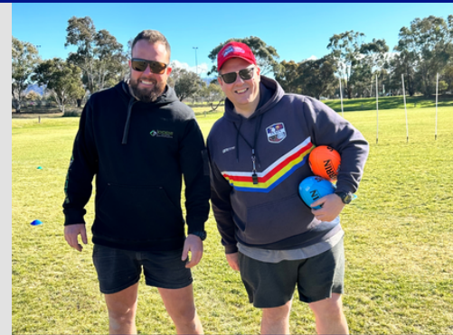
Junior Volunteer of the Month