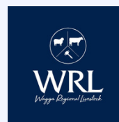
PROUD SPONSOR OF: Polly McKelvie-Hill