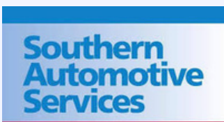
PROUD SPONSOR OF: Rhys Mooney