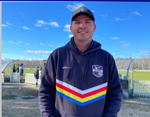
Club Volunteer of the Month