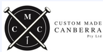
PROUD SPONSOR OF: Ethan Bates