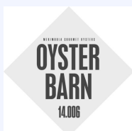
PROUD SPONSOR OF: Lily Bulter-Woollard