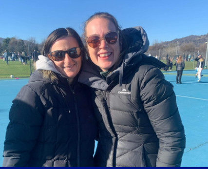
Netball Volunteer of the Month