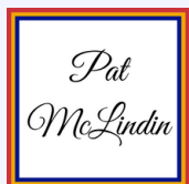
PROUD SPONSOR OF: Erin Shute