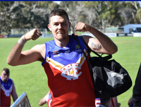
Senior Volunteer of the Month