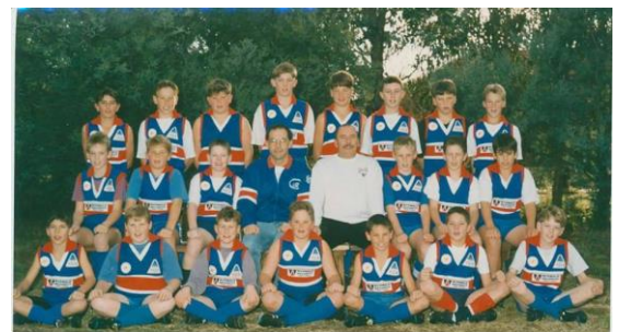
Tuggeranong Bulldogs J.F.C. U12 – 1994 proudly sponsored by Erindale Shopping Centre